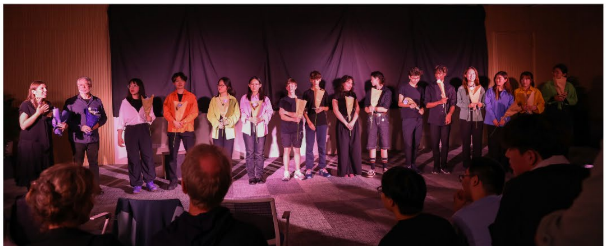
Drama-Rama Festival

As a performer, it was a privilege to go on stage and act out my individual piece that tackled the human struggle of grief in different ways in front of a lively and attentive audience. Overall, I think the drama night was a massive success and a great show for both audience members and actors alike.