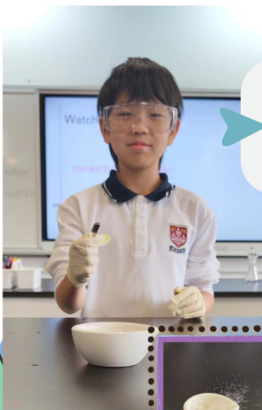
Separating ferromagnetic and non-ferromagnetic substances