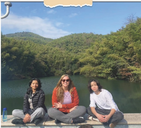
Students and teachers

Students enjoyed the trip to Jiulong Lake, where they took a boat ride, viewed animals, went hiking and enjoyed being out in nature.