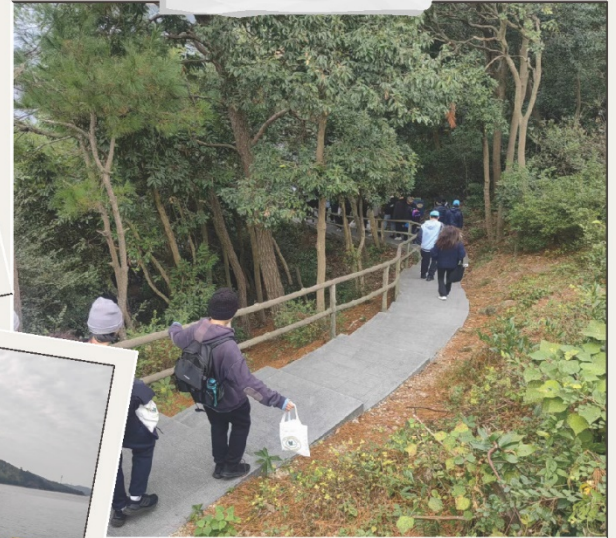
Hiking on Monkey Island