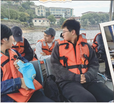
Boat ride to Monkey Island