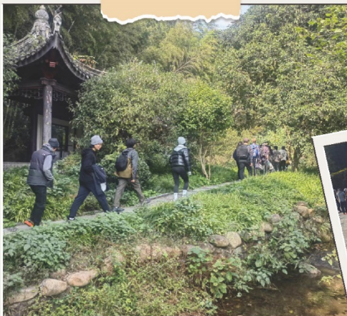
Hiking up to the waterfall