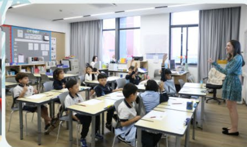
Reading Support and Activities