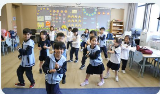
Singing and Dancing