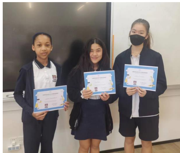
Year 10 winners