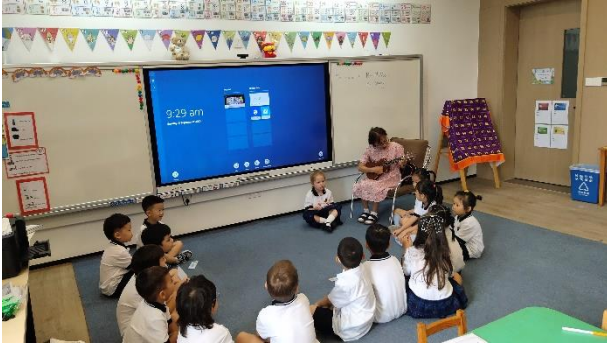
Singing the Hello song together.

I hope you all had a lovely summer holiday. It is very exciting to have all the children back in the classroom now. It will be fantastic to see them all smiling and happy and making great progress, academically, emotionally and socially this year.