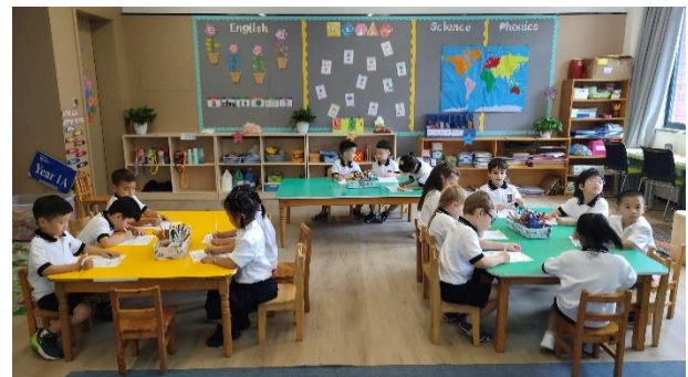
Doing some independent work.