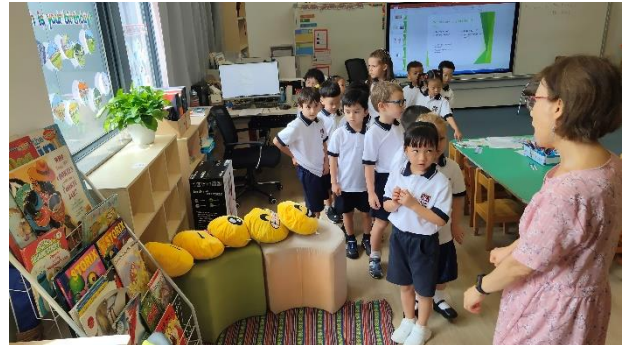
Finding where things are in the classroom.