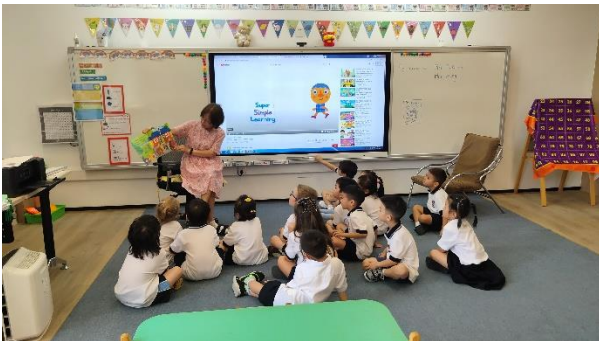
Sharing a story 'Starting School'.