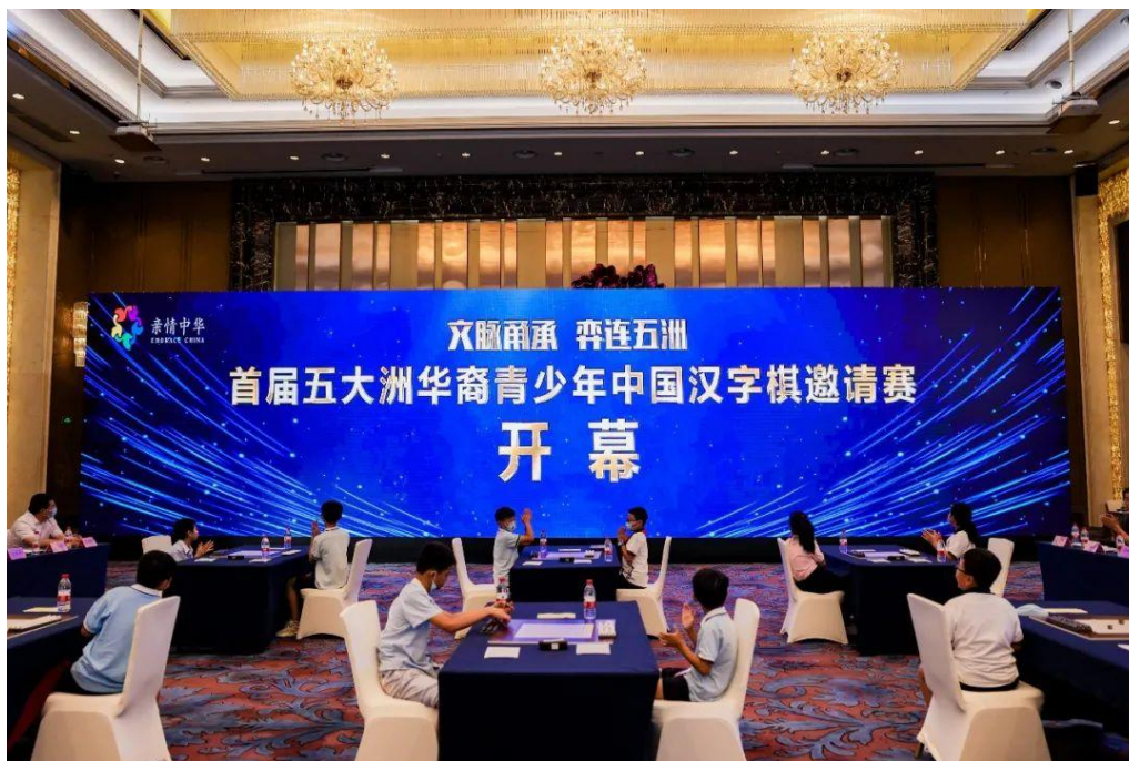
The Opening Ceremony of the 1st Five-continent Ethnic Chinese Youth Chinese Character Chess Invitation

Opening Ceremony of the 1st Five-continent Ethnic Chinese Youth Chinese Character Chess Invitation Tournament was held in Ningbo, Zhejiang Province.