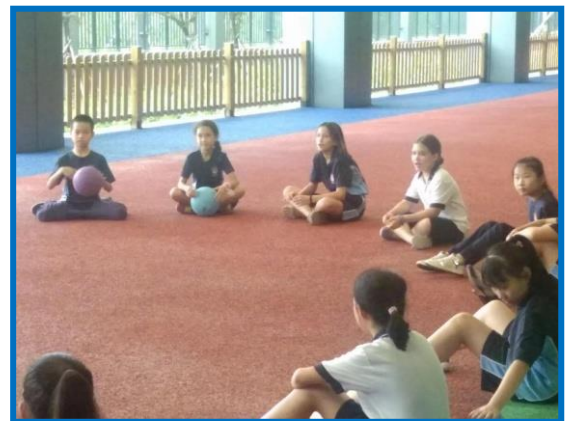
Year 6A in their first PE class

The students of 6A have been bustling about to begin this year with a bang. They have eagerly jumped at the opportunity to form new friendships, and have been taking their time to adjust to their new teachers' styles. Their enthusiasm is palpable, and it has certainly rubbed off on us. We cannot wait to see what these brilliant minds will be able to achieve during the course of this school year.